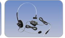
VC-24 VOX Headset