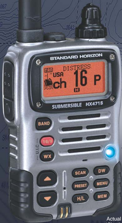
Actual Size *Simulated LCD display