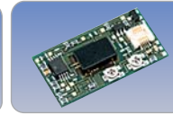
SU-1 Barometric Pressure Sensor Unit