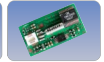
FVP-31 Encryption Unit