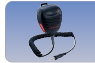
CMP460 Waterproof Speaker/Microphone