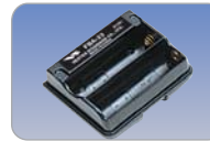
FBA-23 Alkaline Battery Case