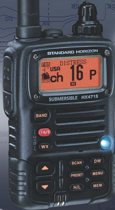
AVAILABLE IN BLACK