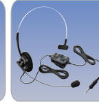
VC-24 VOX Headset