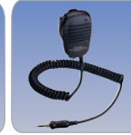
MH-57A4B Speaker/ Microphone