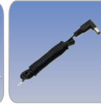
E-DC-6 12V Cable Without Adapter Plug