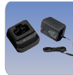
VAC-370B Rapid Charger