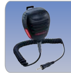
CMP460 Noise Canceling Waterproof Speaker/ Microphone